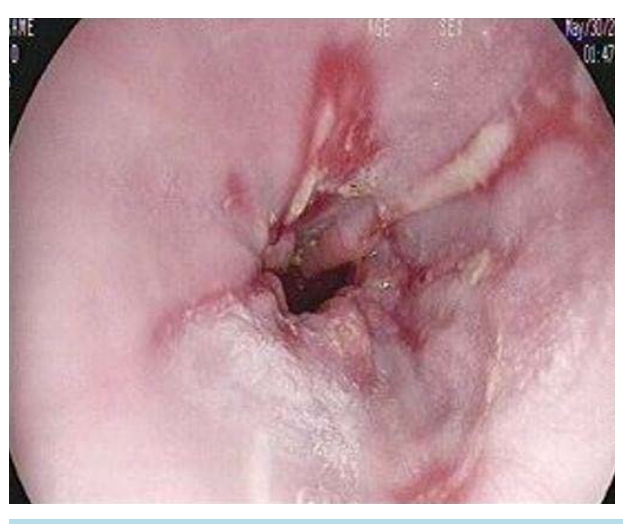
Figure 1. Gastroesophgeal reflux disease Los Angeles class c.

Patient was monitored for signs and symptoms of perforation or bleeding for 6 hours after the procedure. He started liquid diet on the same day and soft diet on the next day after the procedure. Triple therapy was started giving positive CLO test and he was discharged from the hospital after 5 days. All his biochemical parameters were normal before discharge. Follow up endoscopy was performed after two weeks to assess the persistence of dilatation which showed adequate dilatation.