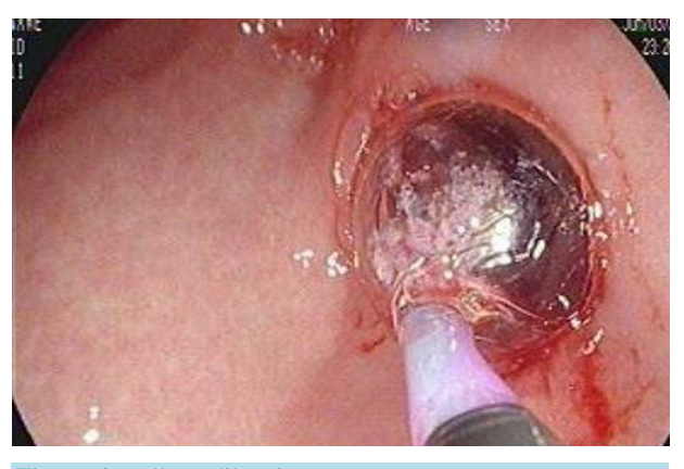
Figure 4. Balloon dilatation.