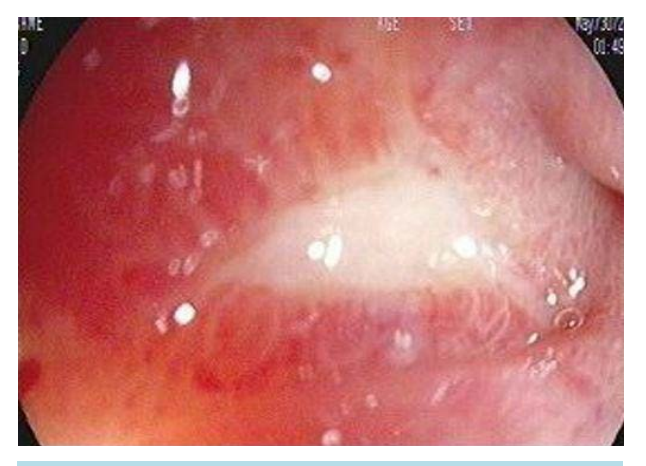
Figure 2. Pyloric channel ulcer.