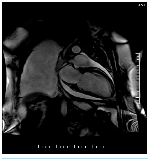
Figure 1. Two chamber view illustrating pericardial effusion.