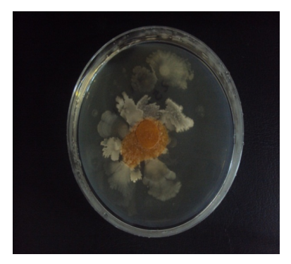
Figure 4. S. aureus 25925.