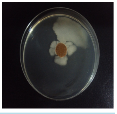
Figure 5. P. aeruginosa 25619.