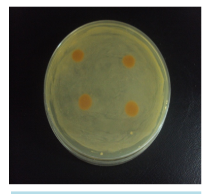
Figure 2. B. subtilis 0516.