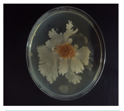
Figure 3. S. aureus 25213.