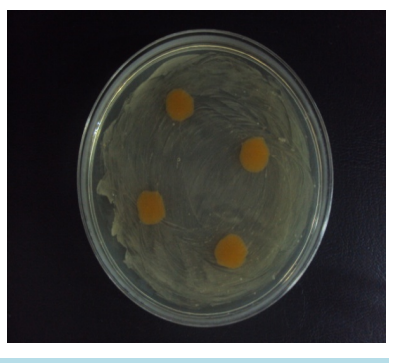
Figure 1. E. coli 8859.

When the bacterial tropism tests were carried out, it was possible to observe an increase in the agar's transparency, and the possible decrease of the microbial colonies' density, except for the strains of Escherichia coli 8859 end Bacillus subtilis 0516 that shows growing across plaque (Figure 1 and Figure 2). However, it seems that there was an increase in the density of the bacterial toxins and the colonies or both around the hydrated clay plasters applied in the center of the plate over the sterile paper filter discs. This phenomenon seems to demonstrate the isomorphic substitution activity in the tetrahedral and octahedral positions in the crystalline structure of the clay minerals when humidified, besides the possible electrodynamics interactions of the organic molecules or colloids in the clay minerals [7] [18] [19] (Figures 3-6).