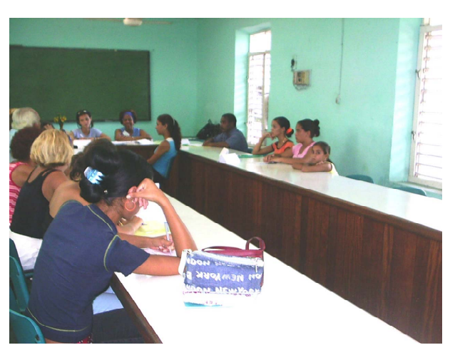
Figure 4. Focal group in Cárdenas city, Matanzas.

Most participants in the focus groups recognized the importance of tourism for its national and local economy. The fol-