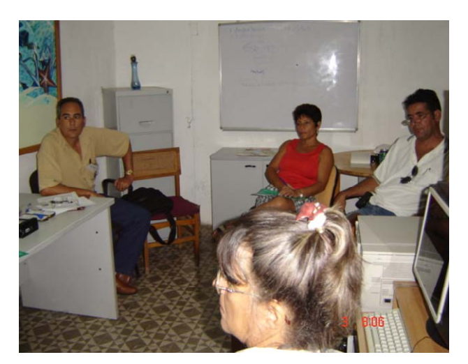
Figure 5. Focal group in Caibarién city, Villa Clara.

lowing are some of the major issues that were identified from the discussions in the focus groups: