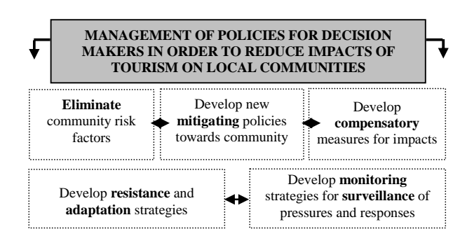
Figure 6. Possible preventive measures of negative impacts perceived by the community.

According to the opinions and behaviors of the participants in the focus groups developed in Cárdenas and Caibarién it is