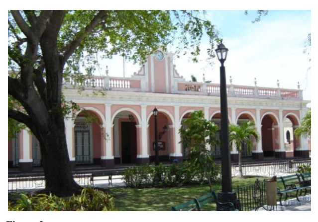
Figure 2. Typical building in Cárdenas city, Matanzas.

Caibarién has a population of 40,798, of which 20,118 are male and 20,690 are female. The population density is 148.89 people per square kilometer. Most of this population, 92 percent or 37,555 people, live in urban settlements. The population is predominantly adult and has a low growth rate and negative immigration rate. The structure of the local political administration is based on 7 popular councils, 3 of which are urban, 1 is suburban and 3 are rural.