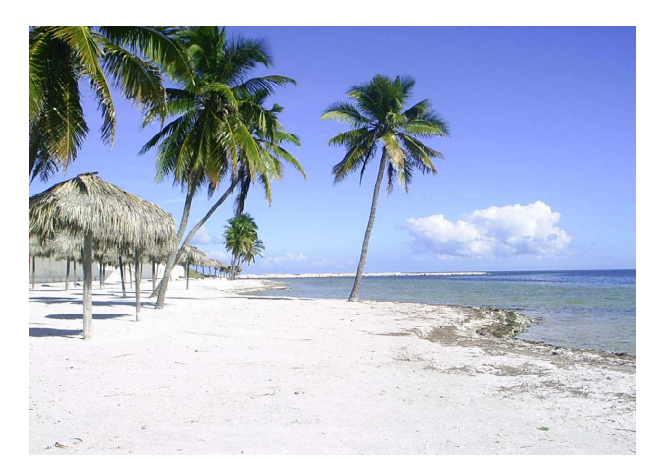
Figure 3. Mar Azul beach, Caibarién, Villa Clara.

Caibarién has experienced important structural transformations in its traditional economy throughout history, which has been the cause of various social impacts. The port development failed in 1930 and the sugar industry ended in 2002 when the "Marcelo Salado" plant closed down under the new national development strategies. The plant was subsequently converted into the Agro-industry Museum while residents were forced to develop other economic activities. Nevertheless, the primary economic sector in the urban setting remained linked to the fishing and the service industries. Then, in the early 1990s, the city reopened to international tourism. Tourism proceeded to become an important local economic activity. It now takes place in the glorious beaches along the coastal cays, more than 50 km from Caibarién.