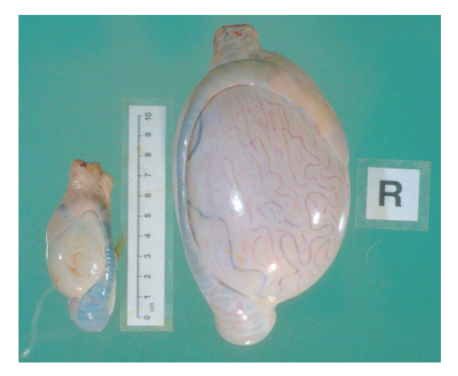
Figure 1. Normal right testis (R) and cryptorchid left testis, located at the entrance of the internal inguinal ring, from an adult ram. The cryptorchid testis is small and relatively elongated, the body of the epididymis is shortened; slight melanin pigmentation of the epididymis is an incidental finding.