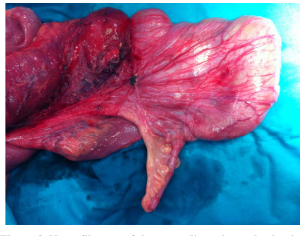
Figure 3. Neurofibroma of the appendix acting as lead point for the intussusception.

unsuspected and it is typically established only during laparotomy. Surgery is mandatory in the treatment of adult intussusception [2]. Adult intussusception often presents with nonspecific symptoms. Preoperative diagnosis remains difficult and the extent of resection, and whether