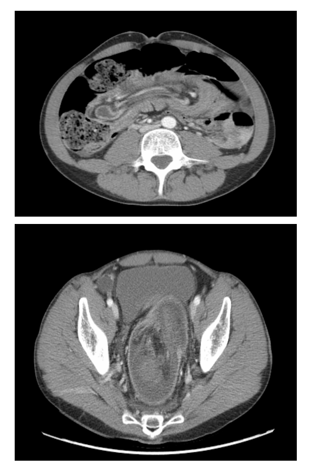
Figure 1. Abdominal computed tomography: intestinal intussusception prolapsing through the rectum.