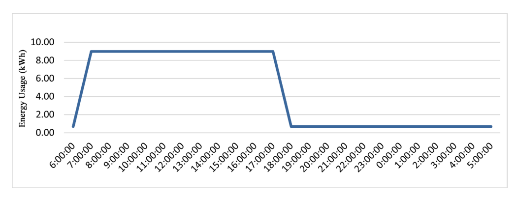
Figure 3. Energy use pattern for bank B.