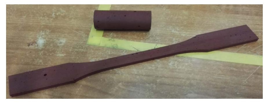
Figure 1. Bubbles in specimen.

In order to reduce the air entry in the process of glue mixing and glue transformation to syringe, a set of vacuum and glue device is manufactured, as shown in the Figure 2 . A vacuum tank is about \emptyset 350 mm, and height is about 500 mm