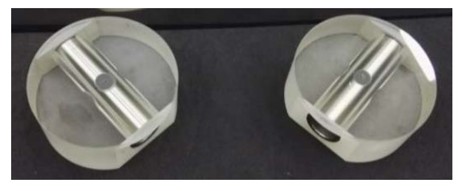
Figure 5. Surface figure specimen of EC2216.

Table 4. Surface figure error change using degasing Milbond.