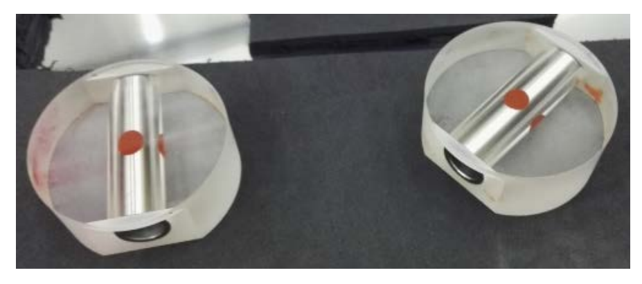
Figure 4. Surface figure specimen of Milbond.

Table 4 and Table 5 show surface figure error change using degassing epoxies. Table 6 and Table 7 show the surface figure error change using without degassing epoxies [4]. As can be seen from Table 4 to Table 7 , comparing degassing and without degasing, the average surface figure error increment change