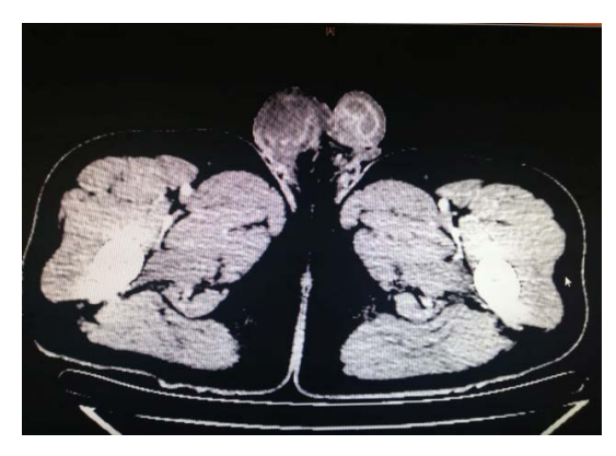
Figure 4. Pelvic CT scan revealing a right scrotal tissue nodule enhanced after contrast compatible with a malignant lesion.

The digestive tumor markers were strongly positive CA19-9 at 430 U/ml and ACE 18.9 U/ml after two weeks of the surgical procedure, the patient presented with intestinal obstruction put under rehydration with corticosteroid therapy with good progress.