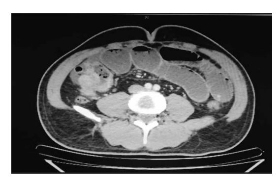
Figure 3. Abdominal CT scan showing digestive thickening of the last ileal loop, irregular circumferential responsible for stenosis of the digestive lumen. with abdominal lymphadenopathy with multiple peritoneal tissue nodules.