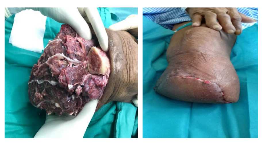
Figure 5. Healthy muscle and bone seen over the proximal stump intra operatively and wounds seen during post op examination was clean and no discharge from wounds site.