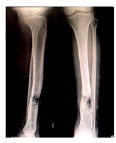
Figure 4. AP and Lateral view of distal 1/3 tibia shows pathological fracture with anterior and lateral cortex radiolucent area in late presentation.