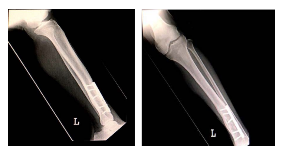
Figure 2. Radiographs reveals findings compatible with chronic osteomyelitis of tibia.