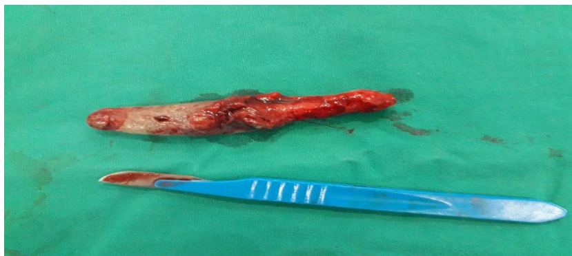
Figure 3. Appendectomy patch for appendicular abscess.

drainage alone (delayed appendectomy) in 3% of cases ( n = 2 ). The anatomopathological study was carried out on all surgical specimens, thus confirming the diagnosis of appendicular abscess. On cytobacteriological examination of the pus, the most found germs were Escherichia coli in 51%, Klebsiella oxytoca in 16%, Klebsiella pneumoniae 13%, Enterobacter cloacae 11% The germs found were 100% sensitive to imipenem. The length of hospitalization was 6 days (range: 2 and 17 days).