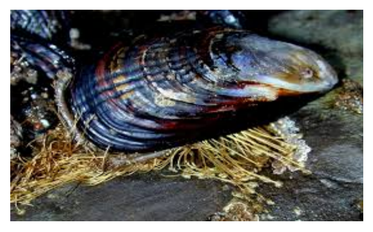
Figure 5. Mylitis californiansis [79].