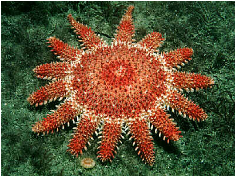
Figure 2. Crossaster papposus [76].

The enhanced respiration rates of faunal community through temperature raise affect the carbon balance of macroalgae assemblages which declines net productivity of seaweed and due course of time species richness [39]. The crab has good sustainability for temperature and pH variation in the intertidal regions. However, the effect of these combined two factors leads to decline its resistivity and its population. This in turn exhibited a potential long term adverse effect on the ectotherm. The sea anemone Actinia equina ( Figure 3 ) in the rocky Mediterranean coast exhibited the growth of polyp will shunted along with reduced biomass during the raise of temperature [40]. The brown dinoflagellates ( Symbiodinium californium , A. T. Banaszak, R.Iglesias-Prieto & R. K. Trench