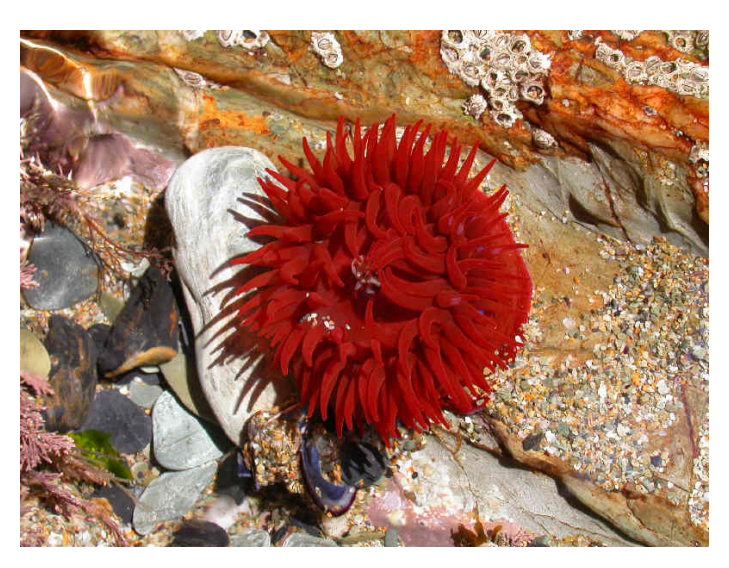
Figure 3. Actina equina [77].

and S. muscatinei, La Jeunesse & R. K. Trench) called zooxanthellae translocate during the high temperature to the host [41] [42].