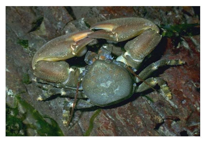
Figure 4. Porcelein crab [78].

The existing literature was stated that the studies on intertidal fauna and flora for the impact on climatic variables executed only for few groups of organisms. The number of other intertidal fauna like polycheate, sponges, hydroids, bryozoans, etc., ( Table 1 ) is not known for its effect on the temperature and pH changes in the intertidal mechanism, which is highly essential for the food web of marine trophic as a total. If scientific community does not understand its effect, which in turn estimation of the range extension of faunal distribution will become more cumbersome and effect on the climatic variable will not be understood fully