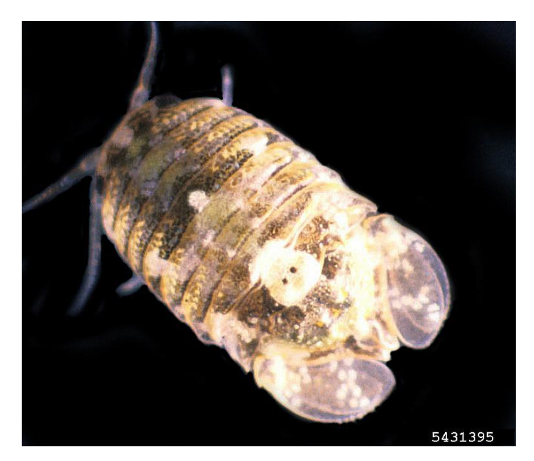
Figure 6. Parandella dianae [80].