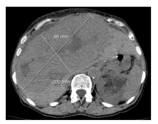
Figure 2. Abdominal CT image showing the growth of the liver mass.

In a multidisciplinary team discussion, the liver metastases were considered unresectable, and the patient was proposed to palliative ChT. The patient was very symptomatic with abdominal pain and a Performance Status (PS) of 2. She started prednisolone 20 mg twice daily (bid), omeprazole 40 mg once daily (id), morphine sulfate 60 mg bid. After discussing potential benefits and risks, it was decided to start palliative ChT. The expression of HER 2 was not yet available and the patient was afraid of neuropathy, so the scheme chosen was FOLFIRI (irinotecan/calcium folinate (LV)/5 fluorouracil (5-FU)), which she started in June 2017. The ChT was very well tolerated and the best response was partial response on CT scan (Figure 4), accompanied by a great improvement in quality