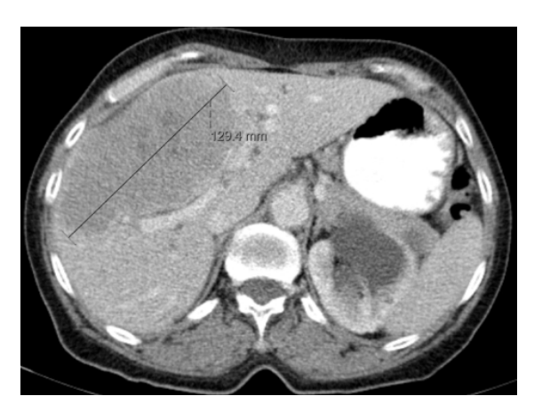
Figure 1. Hepatic lesion assumed as benign (hemangioma) on the staging CT scan.

In December 2016, a woman without relevant pathological backgrounds, born in 1952, was diagnosed with gastric adenocarcinoma in an upper endoscopy made because she presented epigastric pain. In the thoraco-abdomino-pelvic CT scan of staging performed, the patient presented a liver image that was assumed as benign (Figure 1). In a multidisciplinary team, the patient was proposed to surgery