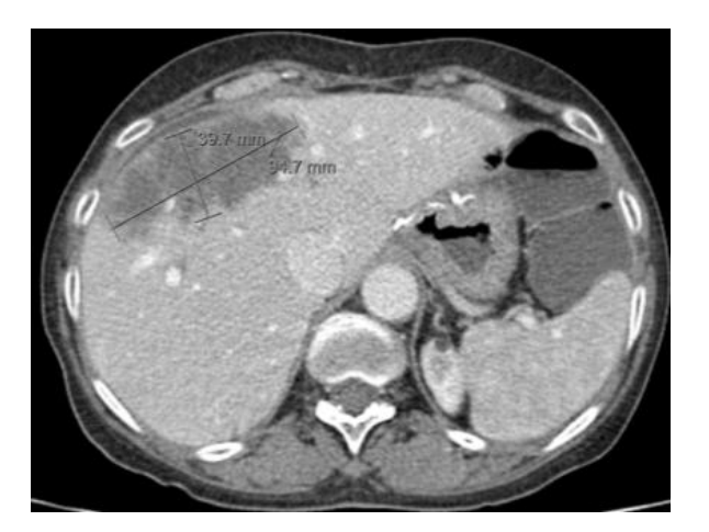
Figure 4. Evolution of hepatic metastasis after 5 cycles of 1st L palliative ChT.

of life (QoL) and in pain control. In October 2018 the patient had PS 0 and the only medications needed were omeprazole 20 mg id and prednisolone 5 mg id. FOLFIRI schedule was maintained until November 2018 (30 cycles). In October 2018, the patient developed dorsal and lumbar pain. She underwent a thoraco-abdominal-pelvic and spinal CT, where she presented multiple new vertebral bone lesions, with stability of the hepatic mass and no evidence of other new lesions; disease progression was assumed.