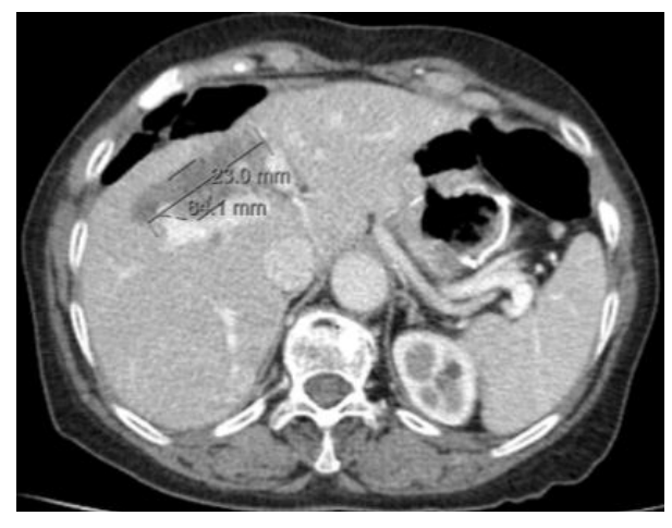
Figure 5. Evolution of hepatic metastasis after 3 months after discontinuation of 2<sup>nd</sup> L ChT.

The National Comprehensive Cancer Network (NCCN) guidelines recommend that gastric resections should be reserved for resectable disease. On the other hand, Japanese Gastric Cancer Association (JGCA) guidelines suggest that surgery should be considered in certain patients in whom it may be beneficial; the issue remaining the selection of patients [10].