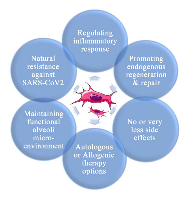
Figure 3. Role of MSCs in nCOVID-19 treatment.