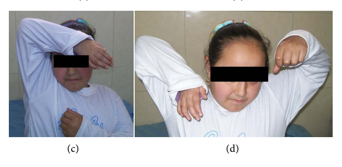
Figure 4. (a) Preoperative; (b) Before cast removal; (c) & (d) Six months postoperative.