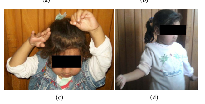
Figure 3. (a) Preoperative; (b) Before cast removal; (c) Six months postoperative; (d) Twelve months postoperative.