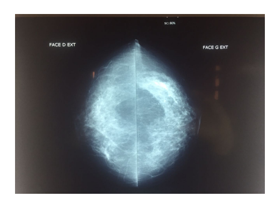
Figure 1. Mammography: architectural disorganization in the left breast.

The evolution was good with a total regression of the lesion and without any recurrency in the last 12 months.