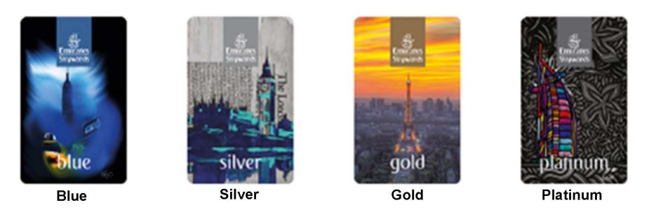
Figure 3. Rewarding membership tiers. Source: [9] [91].

covering every step from conception, creation and design to delivery, implementation, management, and support. A customer is central to EAs' strength in the airline market. Customers are the ones who reflect the good or bad services of the company, whether they are fully satisfied or disappointed. EAs offer customers all they need during its operations and processes, as well as on the flights themselves, to keep customers happy.