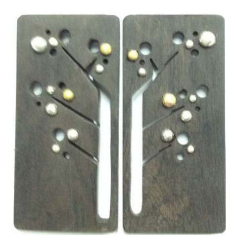
Figure 2. Pendant.

three-dimensional and layering effect to this handicraft. For avoiding the depressing feeling, the designer adopts many methods cause the jewelry to be lively and vivid. On part, seemingly disparate permutation contain certain rules. The chiaroscuro caused by yellow brass, white silver and ebony. Rectangle contrasts with round in shape. Fresh and natural visual effect of the works appeal to the tidal current of "Return to nature" (Qian, 2016).