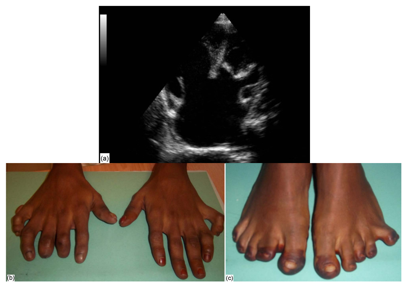
Figure 3. Atrioventricular septal defect (a) and associated limb deformities (b), (c) in a patient with Ellis Van Creveldt syndrome.