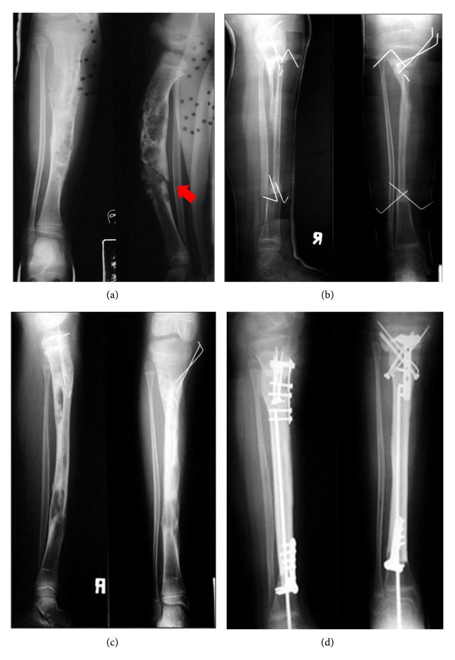
Figure 1. A 7-year-old boy. Osteo-Fibrous Dysplasia (OFD) (A case of tumor excision, LFG, first, and allograft for late recurrence). (a) Poly-ostotic cysts, shin splint with shaft fracture suggesting OFD; (b) LFG from opposite leg after wide excision of affected tibia; (c) One year after the LFG, solid union and hypertrophied grafted fibula but recurred OFD was recurred; (d) 9 months after the allograft after complete excision of tibia, solid bony union was obtained. The end result in 14 years follow-up was good.

which originated multifocally from periosteum and even adjacent soft tissues too, and so inevitable to incomplete excision at the first operation. Complete re-excision of recurred OFD and allograft was done again (Figure 1(d)), and finally obtain the solid bony union on 9 months after allograft and cancellous chip bone grafts together (Figure 1(d)). The end result was good on 14 years follow-up (Table 1).