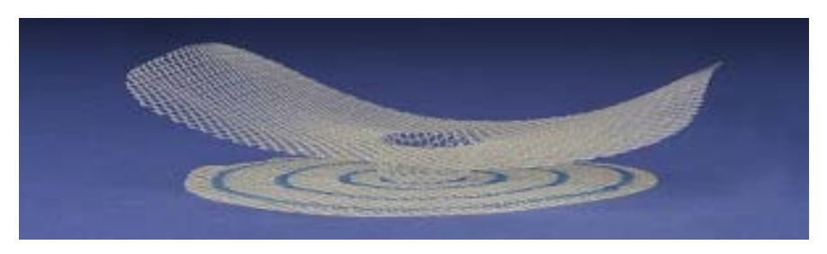
Figure 1. Ultrapro hernia system.

spermatic cord, and separation of the hernia sac from the cord contents and the sac is then, transfixed ligated at its proper neck.