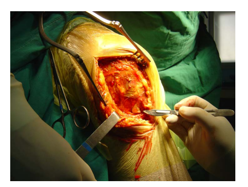
Figure 1. On initial dissection superficial MCL completely detached.

Under GA and tourniquet application the medial side and posterior corner of the knee was explored. Both parts of the MCL were completely destroyed and the remnants of the ligaments were frail (Figure 1). First the posterior corner was stabilized with advancement and suturing of the capsule. Through the same incision with simple elevation of the ruptured medial collateral ligament the medial meniscus and ACL were inspected (Figure 2). The meniscus was detached in its periphery but otherwise intact and the ACL was in continuity but loose. Because of the extensive MCL damage we decided to augment the repair with a freeze dried Achilles tendon allograft (Figure 3). A part of the graft was properly shaped and weaved through the superficial-deep ligament complex (Pulvertaft technique). Both insertions were stabilized to the femur and tibia by the use of bone anchors and in maximal tension. The medial meniscus was sutured to the deep ligament and the ACL was not further addressed (Figure 4 and Figure 5).