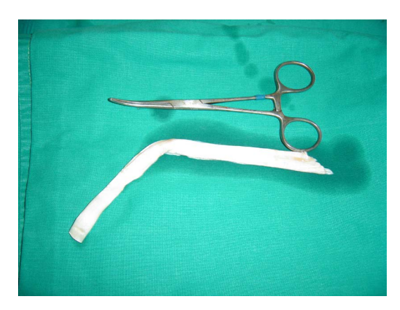
Figure 3. Freeze dried Achilles tendon allograft.