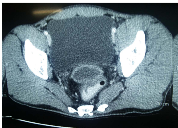
Figure 5. CECT of 2 nd case showing retrovesical pelvic hydatid cyst.