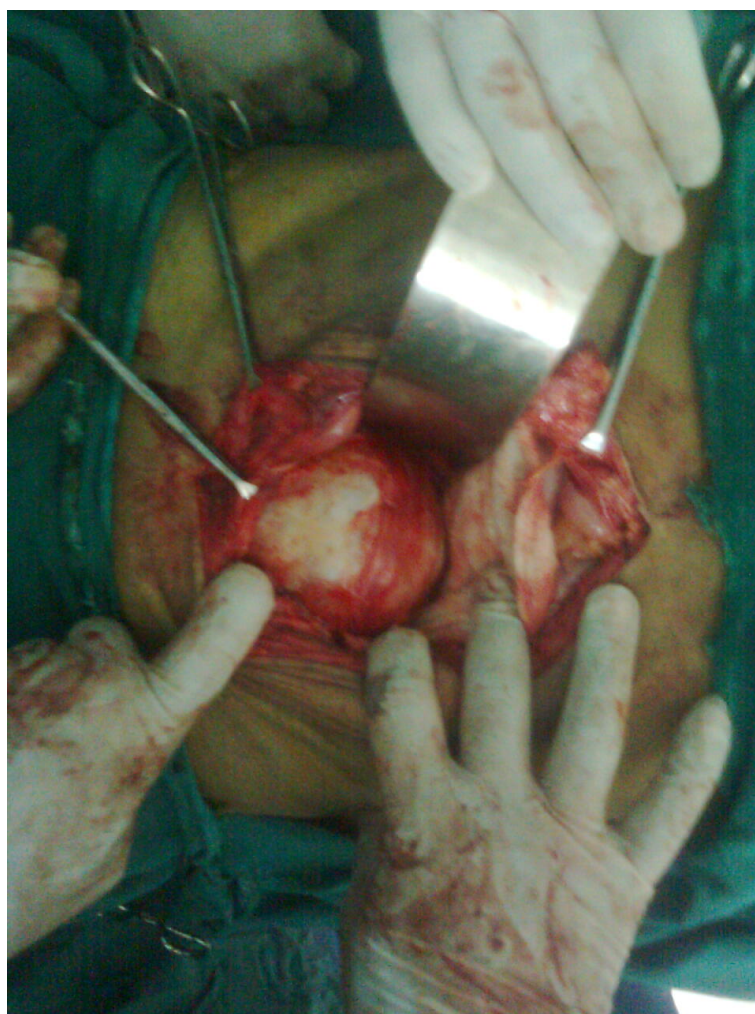
Figure 3. Showing operative procedure.