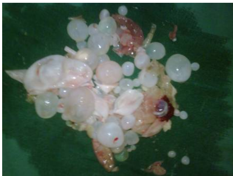
Figure 4. Daughter cysts removed from pelvic cavity hydatid cyst.