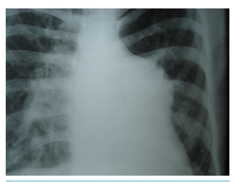
Figure 1. Chest X-ray showing cardiomegaly with increased pulmonary vascularity along with a prominent convexity on left margin of cardiac shadow, suggestive of rudimentary outlet chamber.

Double-inlet left-ventricle accounts for about 1% of all congenital heart malformations. Holmes heart, i.e. double-inlet left ventricle with normally related great arteries, is still rare. There is no precise information regarding the prevalence of Holmes heart, apart from a few case reports in the modern literature. The characteristic features of Holmes heart include absence of the sinus (body or inflow tract), double-inlet left-ventricle, and