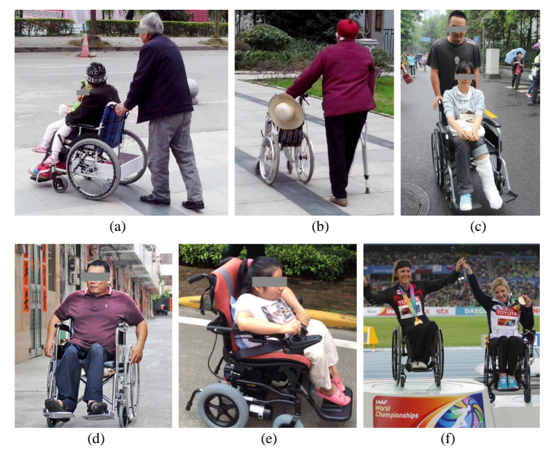
Figure 1. Some typical WUs.

Ws, WUs and NSs constitute interactional "Wheelchair-user combination, WUC". Moreover, the new system is composed of WUs, Ws and NSs. In addition, the WUC includes not only the "WUs-Ws-NSs system" composed of WUs, Ws and NSs, but also the "WUs-Ws system" that some WUs have the stronger self-care abilities and do not need special nursing staffs. Figure 2 shows the composition of WUC and can reflect the basic relationship among WUs, Ws and NSs.