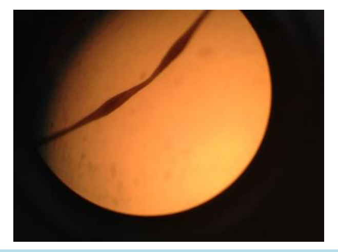
Figure 3. Light microscopy of the hair.