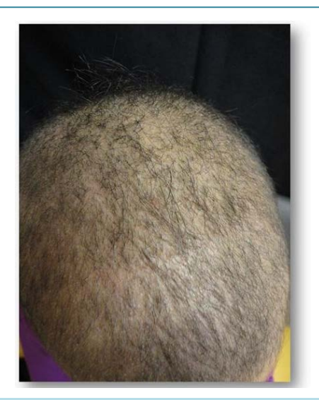
Figure 1. Clinical findings.