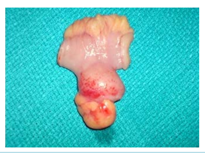
Figure 3. Resected operated specimen.