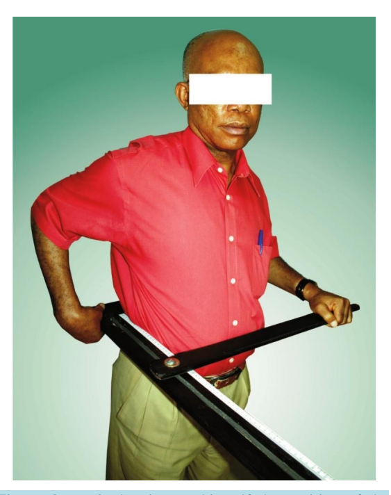
Figure 2. BNO showing on himself the position of the abdominometer on the anterior abdominal wall at the level of the umbilicus for reading off of AH.