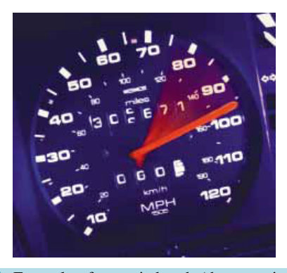
Figure 1. Example of occupied path (the occupied path of hand of vehicle speedometer).

2) In Figure 2, the mutual occupying and leaving of universe's regions by the boson b_j made the relation between the occupied volume of b_j and its wavelength \lambda_{b_j} .