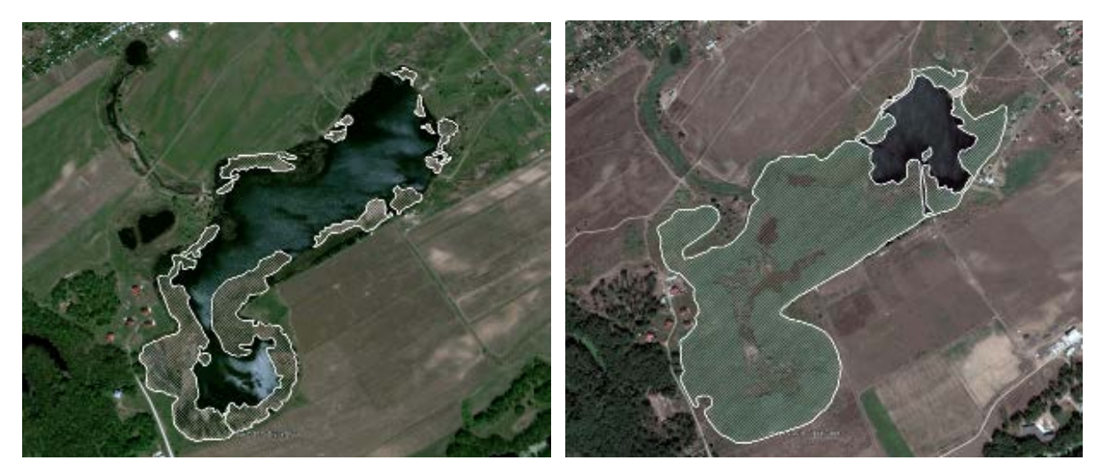
Figure 2. Area being inhabited by air and aquatic plants. Left-2002, Right-2014.

a heavy anthropogenic impact prevail. Most part of the local flora consists of adventive species which act as subdominants in some areas. Animal species of the model territory comply with those inhabiting the landscape anthropogenically affected.