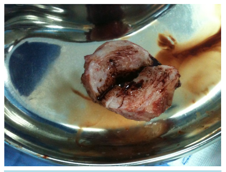
Figure 3. Cross-section of rudimentary horn.