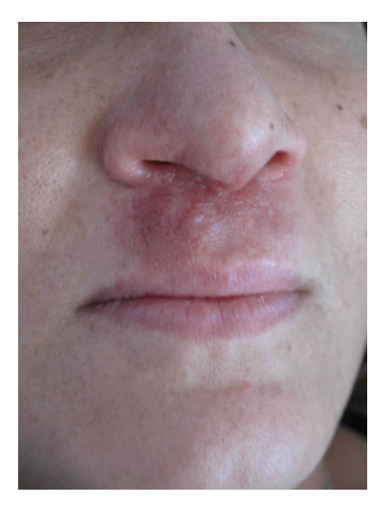
Figure 2. Aspect of the nose and nasal mucosa after two weeks of treatment.

The clinical diagnosis of mucosal leishmaniasis was based on lesion appearance and epidemiological analysis [8]. Differential diagnosis arises with other infectious diseases (mycobacterium, paracoccidioidomycosis, histoplasmosis, blastomycosis, Klebsiella rhinoescleromatis), tumours (lymphomas, carcinoma, midline granuloma), relapsing polichondritis, sarcoidosis and Wegener disease [2,4]. If middle line necrosis is observed, cocaine