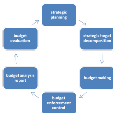
Figure 2. Comprehensive budget management.