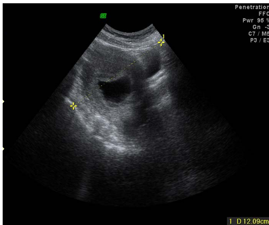
Figure 1. Ultrasound image of the pelvis showing the pelvic inlet diameter measurement.

The statistical package for social sciences for Windows version 17.0 (SPSS, Inc, Illinois, USA) and Excel 2003 (Microsoft Corporation, USA) were used to perform statistical and graphical analysis of all data. A “p” value of 0.05 or lower was considered statistically significant. The study was approved by the Institutional Ethics Review Board.