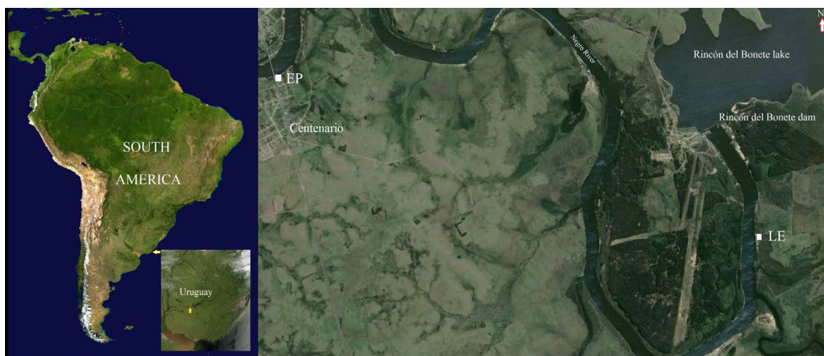
Figure 1. Map of South America and the location of El Puente (EP) and Los Espinillos (LE) sites in the middle Negro river area which is pointed with an arrow in the map of Uruguay (after Google Maps, 2014).

A brief description of each piece follows, with dimensions (length, width, and thickness in mm) in parentheses. EP ( 35.8 \times 19.9 \times 5.6 ) is a red chert Fishtail stemmed point; the stem length 15.7, width 14.1 and 16.9 mm in the center and base respectively ( Figure 2(a) ). Base thinned by deep retouches of almost the length of the stem ranges between about 7 - 11 mm on one side and up to 13 mm on the other. It shows a non regular pressure flaking pattern. The flake-blank used for its manufacture is evident by the remains of its ventral face, visible in the upper right part of the reverse face. It is made on a high quality red rock (probably a silcreta from the Queguay formation) similar to Chuska chert from Colorado, USA. Texture and brightness might suggest that the raw material was subjected to heat treatment, such as has been experimentally observed in similar rocks from the area (Nami, 2010). LE ( 30.5 \times 20.9 \times 7.2 ) is made from very good quality homogenous pale brown chert ( Figure 2(b) ). Starting at the tip, it shows a flake scar ending in step fractures, possibly produced by impact. The blade is 14 mm long and the stem is 20.3 long by 17.4 and 19.8 mm wide in the middle and base respectively. The stem base was thinned by short pressure retouches less than 5 mm in depth; however one deeper retouch of about 14 mm length by 7 mm wide was applied. Both points show that the stem edges are highly abraded, a usual feature