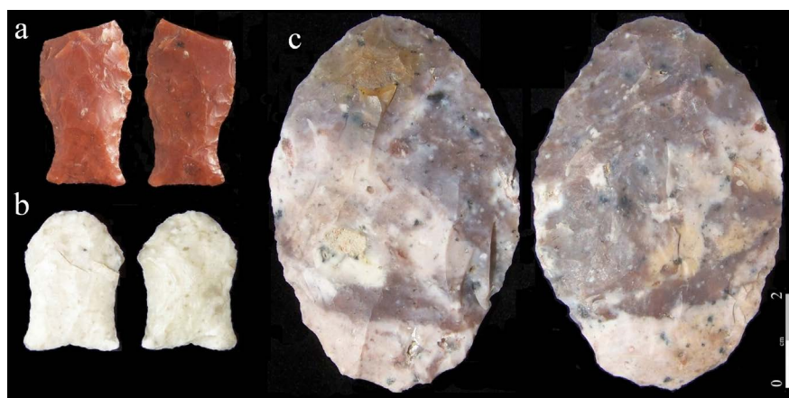
Figure 2. (a)-(c) Obverse and reverse views of the new by Paleo-South Americans specimens reported in this paper. Fishtail points from EP (a) and LE (b); (c) biface from LE.