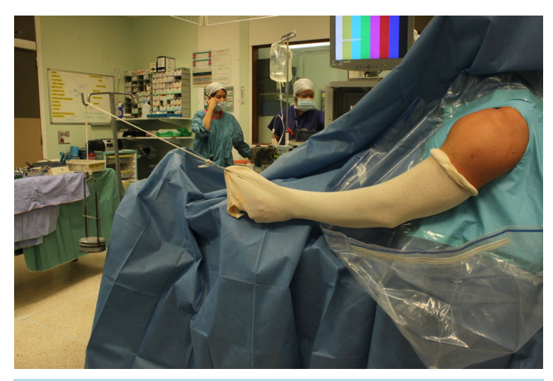
Figure 7. The set-up with drapes prior to final drape over unsterile area of hook through stockinette and its traction cord with weights.