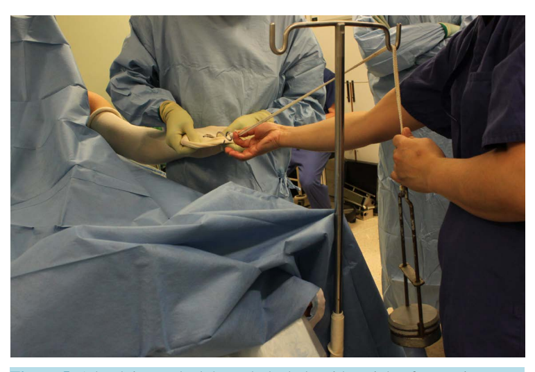
Figure 5. A hook is attached through the hole with weights for traction.