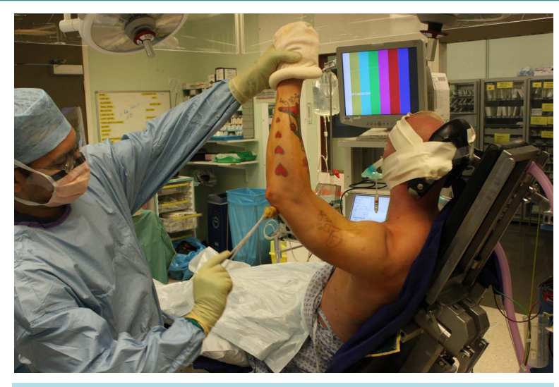
Figure 1. Preparation of the limb with Friar's Balsam after skin preparation.