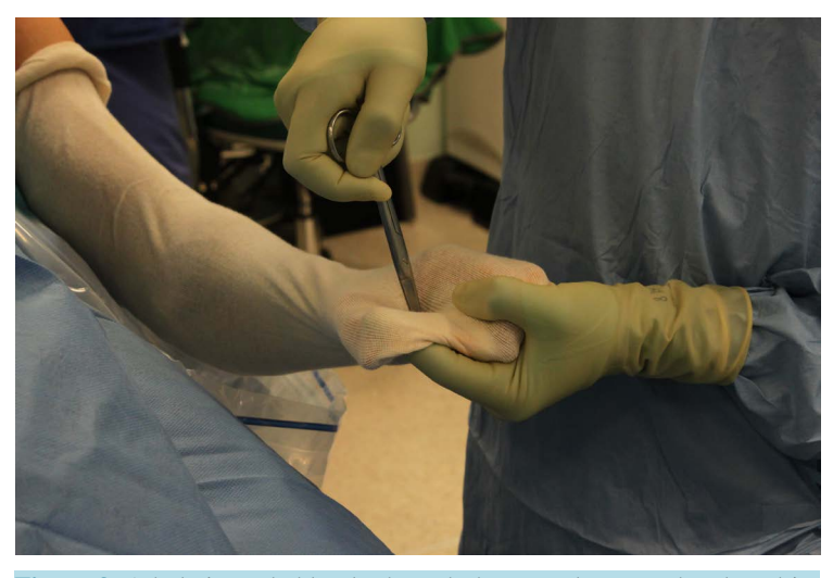
Figure 3. A hole is made bluntly through the space between thumb and index finger.