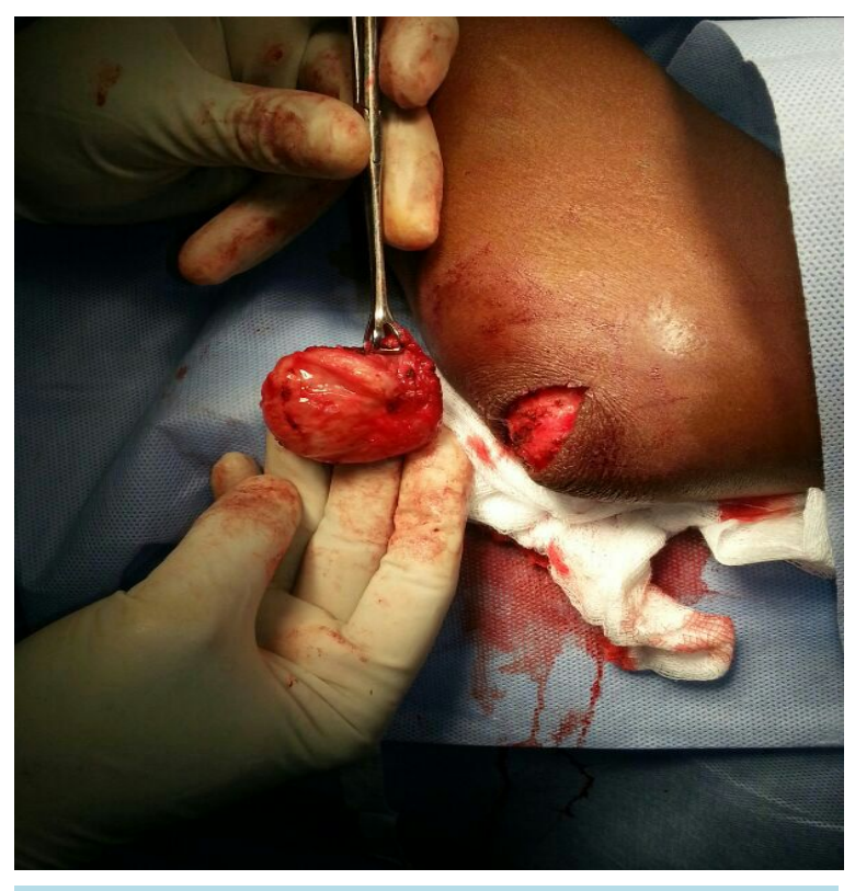
Figure 3. Complete excision of the left olecranon bursa.