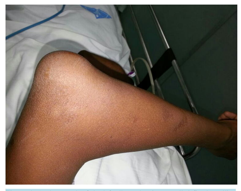
Figure 1. A photograph of the left elbow showing a well defined swelling overlying the olecranon.

Olecranon bursitis can be classified as aseptic (chronic) and septic (acute). Aseptic olecranon bursitis is more common and is usually a result of repeated, low intensity trauma to the elbow as seen in miners, students, carpet-layers, book-keepers and gymnasts [3] [4]. Other rarer causes include systemic inflammatory processes like