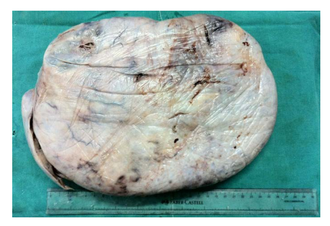
Figure 1. External surface of tumor after draining fluid.

The tumor was having upto 60% cystic and 40% solid component. The cystic component was lined by flattened epithelium in majority of areas and very few areas showed low columnar cells with cilia. (Figure 3) The solid component was composed of ill-defined fascicles of elongated cells with moderate cytoplasm and elongated nuclei. These cells are intermixed with cells with moderate amount of eosinophilic cytoplasm and round nuclei