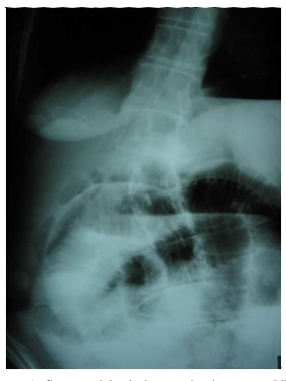
Figure 1. Contrast abdominal x-ray showing pneumobilia and small bowel obstruction.

A 72-year-old, female, patient presented with a 36-hour history of abdominal distention, colic pain and bilious vomiting. There was no history of abdominal surgery. The patient's abdomen was distended, although soft, with increasing bowel sounds. Physical examination disclosed evidence of hernia. Concomitant diseases involved cardiovascular disorders and diabetes mellitus. Laboratory tests were nonspecific and showed median leucocytosis, dehydration and electrolyte imbalance. The patient underwent nasogastric intubations and correction of electrolyte disturbances. Plain radiographs of abdomen were compatible with partial small bowel obstruction. Contrast x-ray films showed aerobilia and distoped radiopaque abnormality (Figure 1). To clarify the etiology, an abdominal computed tomography scan was obtained. The CT findings showed aerobilia, cholecystoduodenal fistula, dilated small bowel and an intraluminal abnormality in