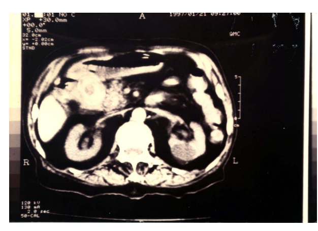
Figure 4. Upper abdominal CT image showing impacted gallstone in the duodenum.