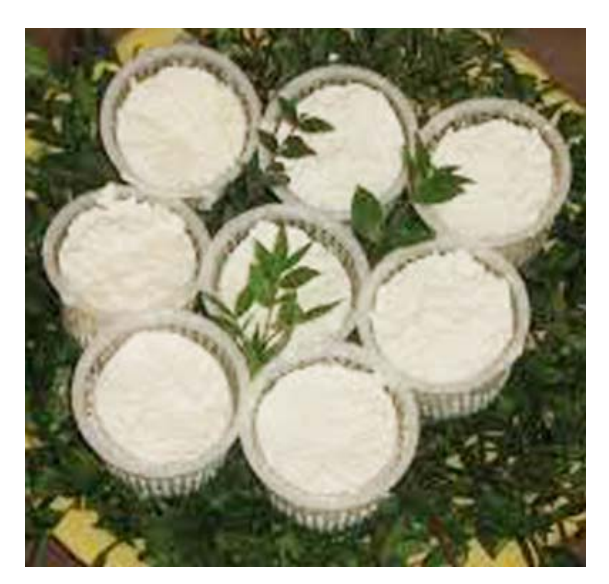
Figure 6. The "Ricotta" cheese.

Uses. Its meat is particularly suited for processing or