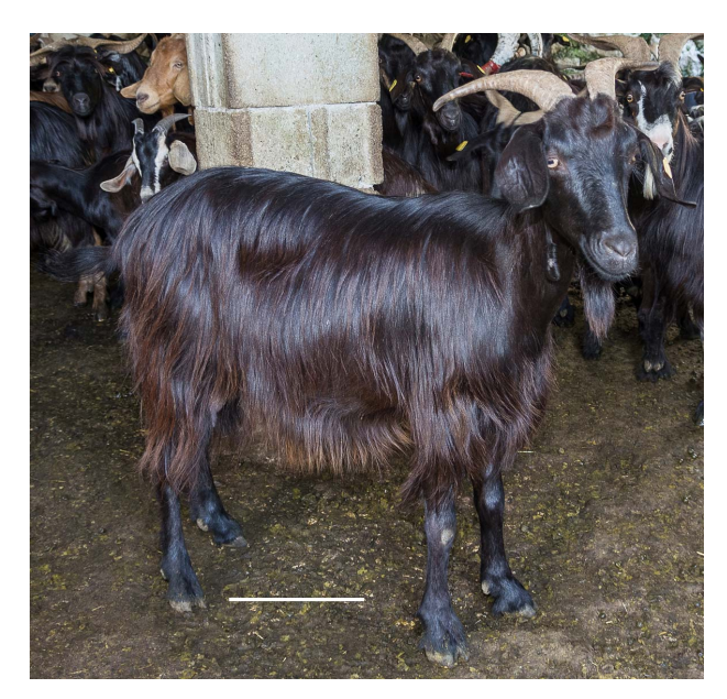
Figure 5. The "Cilentana" black goat breed. Bar = 20 cm.

weight of 65 - 70 kg and 45 - 50 kg in males and females, respectively. It has a small head, horns present in about half of the subjects, mainly of Alpine type, 20 - 30 cm long or of type Garganic type, 30 - 40 cm long.