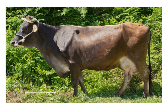
Figure 1. A female cow of "Agerolese" cattle breed. Bar = 50 cm.

Morphological traits. Of medium size with smooth trunk, coat is brown with lighter shade in the abdominal region in females ( Figure 1 ) and with a characteristic black clearer line (mills) in males. The head is light, with a concave profile, large eyes and bright, mediumsized ears, a black muzzle surrounded by a white halo, mediumlength horns, curved in bulls, direct side up and forward in cows. The neck is slightly reduced with a dewlap; proportioned limbs, muscular thighs, strong feet with black