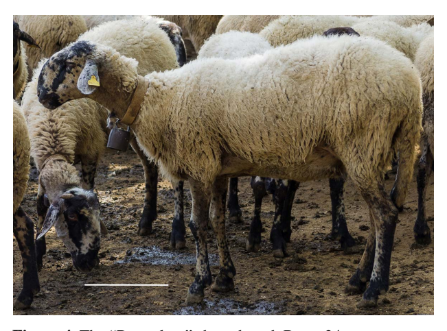
Figure 4. The "Bagnolese" sheep breed. Bar = 24 cm.

upper third, and makes thinner to the hock. The udder is great with globose shape, soft and elastic tissues and clearly defined teats. The limbs are long, strong, lean, with dark-gray and well-shaped claws. White fleece consisting of conical tufts completely covers the body with the exception of the ventral side of the lower region of the neck, head and limbs. The head, neck and limbs are typical of black speckling that, in some individuals, may be large black spots. The skin is elastic and light pink.