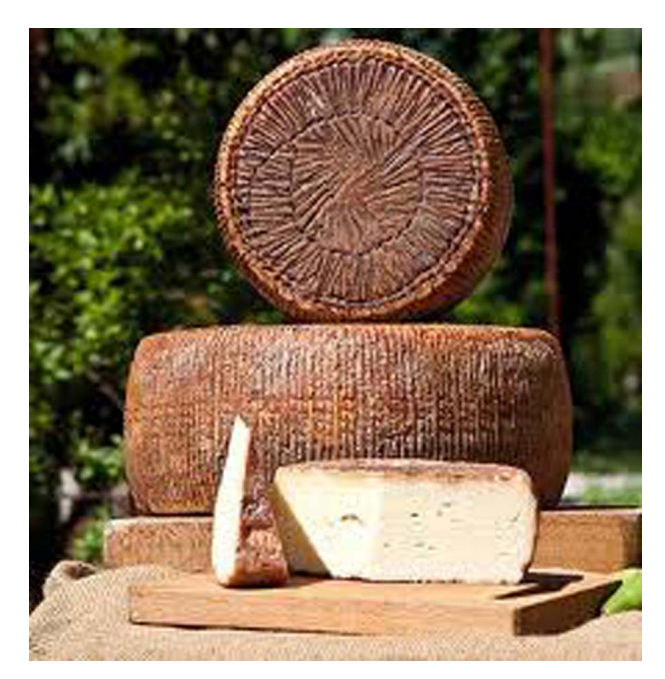
Figure 3. The "Pecorino" cheese.