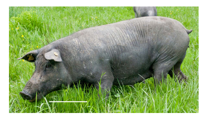
Figure 7. The "Casertana" pig breed. Bar = 40 cm.