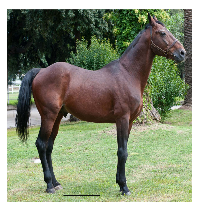
Figure 9. The "Salernitano" horse breed. Bar = 50 cm.