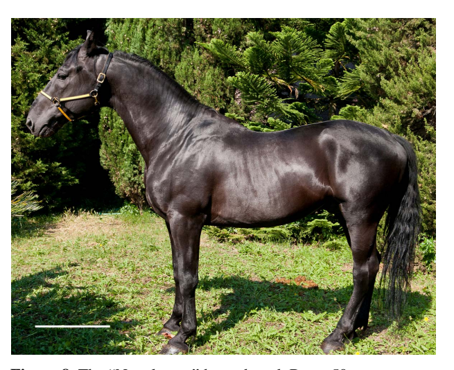
Figure 8. The "Napoletano" horse breed. Bar = 50 cm.

Origins . It was known in the past as Government breed of Persano Municipality, it has its cradle in the plain ex-