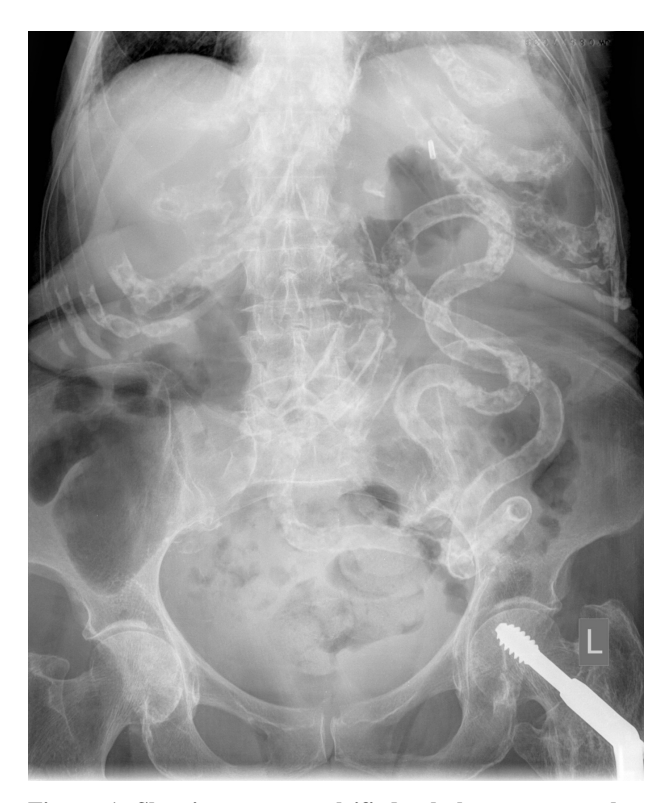
Figure 1. Showing a very calcified tubular structure that was initially confused as a foreign body.