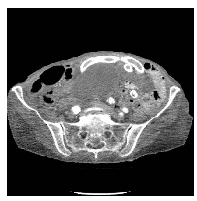
Figure 2. Showing a calcified tubular structure at the very ventral edge of the patient's abdomen.

sporadically reported [2]. Acquired yet non-occlusive mesenteric ischemic (NOMI) conditions include atherosclerotic degeneration of the origin of the SMA, vasculitides affecting the SMA as well as other mesenteric vessels, thrombosis of the left renal vein causing indirect