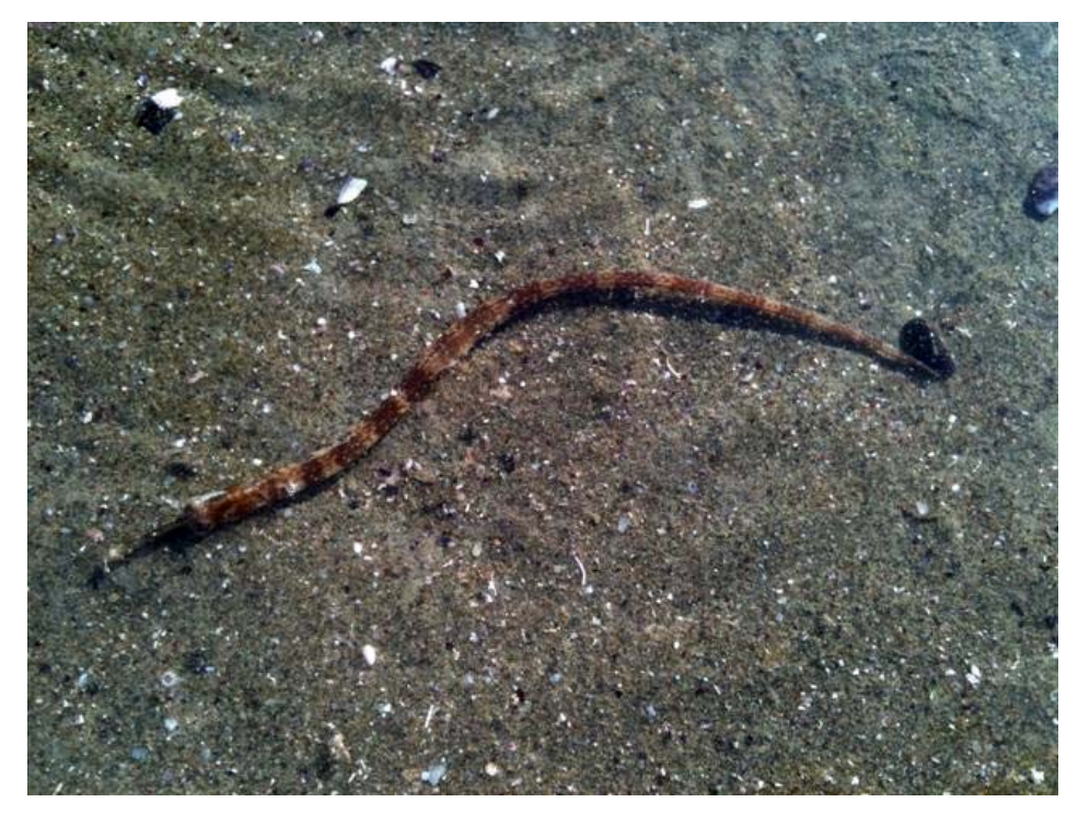
Figure 2. Picture of the specimen of Leptonotus blainvilleanus found in August 2010.