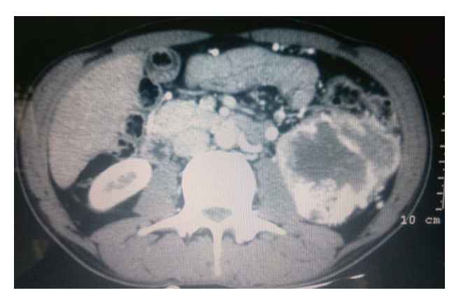
Figure 1. MRI showing a large altered signal intensity mass lesion in the left kidney (areas of haemorrhage indicated by black arrow).