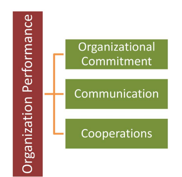
Figure 2. Three C's univariate behavioral approach variables of organizational performance.

dedi cation, cooperation, and communication are investigated as organizational characteristics. The organizational variables are independent here, but employee performance is dependent. The main thing is that people and organizations perform better when greater organizational commitment, communication, and cooperation. However, the study shows the limits of this research. Time and resource constraints are the practical constraints. Observing and studying public servants' performance takes time. The study was limited to the two main locations in Saudi Arabia (Riyadh and Jeddah). Therefore the findings are speculative and may not be generalized. Despite these restrictions, studying Saudi public sector workers from the viewpoint of public sector organizations provides unique and interesting insights into its functionality.