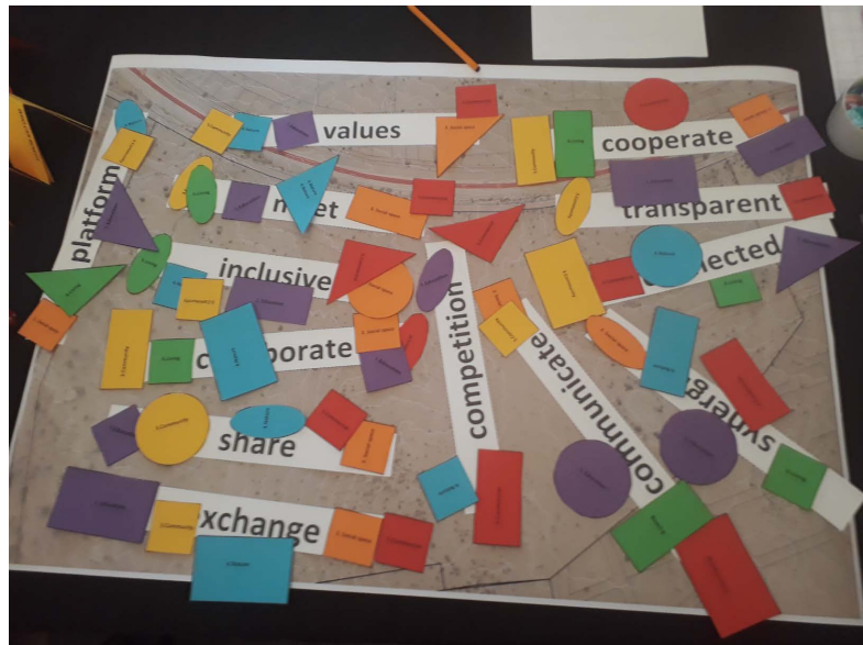
Figure 10. Gameboard method to explore the association participants made between the Dololo IUC platform and possible functions.

apartments, erfs with allowance for urban gardening and outdoor space, those needs were regarded as minimum requirements. The fact of the expressed dislike for one-bedroom apartments could be interpreted variously. One interpretation is that under the harsh conditions of high urbanization rate and poor resources, most families manage to cope with the tight makeshift residential conditions of the informal areas. However, if given the opportunity, they are clear and resolute in their needs for improved family livelihood. The need for student housing was also identified to accommodate learners from other regions of Namibia. In addition, community needs were also identified such as adjacent granny flats to enable residents to take care of extended family members or the elderly. The need for communal areas or designated playgrounds for children within settlements was also identified.