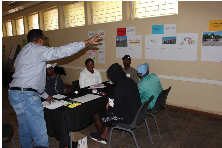
Figure 9. Focus group discussions to develop ideas around the spatial and functional requirements of the proposed IUC.

Thematic analysis of the data was applied to ensure that all identified aspects were considered in the proposed IUC concept. Data from the mapping and gameboard exercises were organized according to the predetermined themes to identify spatial needs, appropriate architectural solutions and to identify socio-economic conditions to evaluate the feasibility of an IUC.