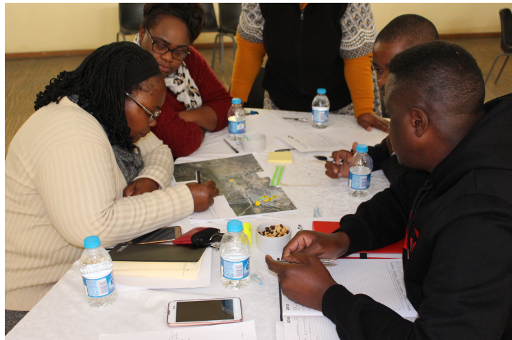
Figure 6. A group of stakeholders indicating areas of opportunity and development on a map of Okahandja and the immediate surroundings.

Structured discussions allowed participants to further investigate their needs related to policy, culture, politics, and economy ( Figure 7 ). This method allowed participants to comfortably share their ideas and to elaborate on points mentioned by fellow participants.