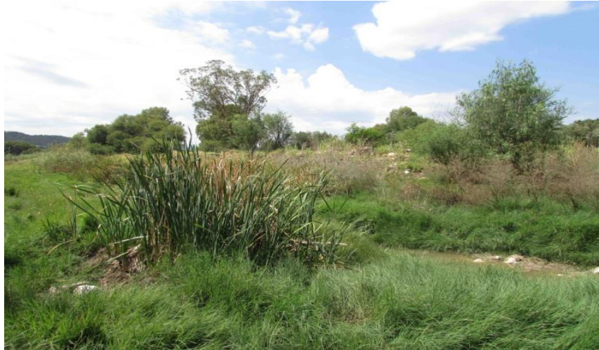
Figure 4. Landscape feature of the project site.

as the University of Stellenbosch in South Africa that is confined to core commercial function. As envisaged in the case of Okahandja, the IUC should include mixed residential complexes, tourism-related retail and leisure, education and research, health and culture infrastructure services. The inclusion and connectivity (the connection between the different urban activities) were some of the key points discussed during the stakeholder engagement meetings, under workshop sessions. In general, the proposed inclusive urban campus initiative is expected to create synergies with the existing town infrastructure layout within the boundaries of Okahandja including the recent Osona Village Development, adjacent to the project site.