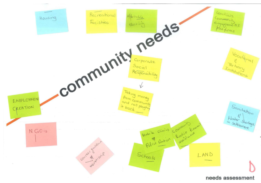
Figure 7. Identification of community needs by the identified stakeholders.