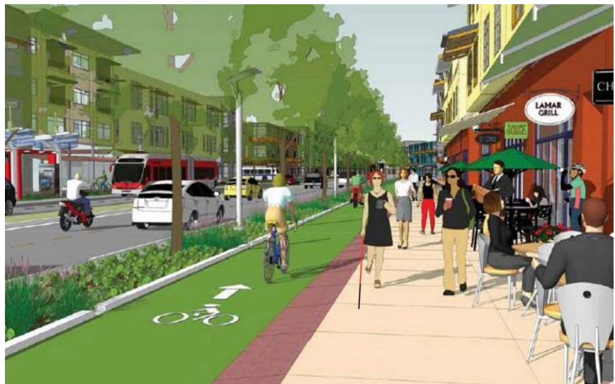
Figure 5. A 3-D model of inclusive urban design.

Urban areas are centers for social interaction, economic advancement and offer copious opportunities and need fulfillments. Some are dominant political, administrative, and cultural centers. This often results in people being attracted to urban centers, which is a misconception, as more people in urban areas are