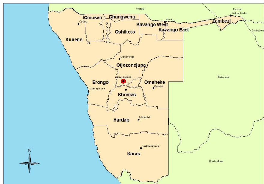
Figure 1. Location of Okahandja Town in the Otjozondjupa Region.

The study site, referred to as Dololo, was volunteered by a public partnership group keen to contribute to the research task. Dololo is 86 ha of land, centrally located and only 30 minutes ride north of the capital city Windhoek and 10 km south of Okahandja town ( Figure 1 and Figure 2 ). It is situated between the B1 and A1 highways, directly adjacent to two fiber optic lines, water, and power supply infrastructure, and the railway line ( Figure 3 ). The platform embodies the territory within the townlands of the Okahandja Municipality, making it an integral part of the town's spatial development in terms of its contribution to the town's spatial design, physical, functional, and management [2]. It is adjacent to the newly developed Osona Village housing project—a very popular housing estate for the low and middle-income workers who commute to and from Windhoek daily.