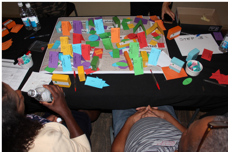
Figure 8. Identification of associations made between the IUC concept, function, and community needs.

Through the interactive game-board activity, participants were able to connect identified needs with the aims and objectives of the project as well as stakeholders that might benefit or contribute to the provision of certain amenities ( Figure 8 ). The focus group was organized around images where participants ( Figure 9 ) could discuss the requirements of the proposed IUC to address issues such as spatial organization, access, ownership, education, social space, living, community, commercial activity, and nature (ecology). Game-boards are used to create scenarios, relate to spatial conditions while considering the different stakeholders involved in the process [22].