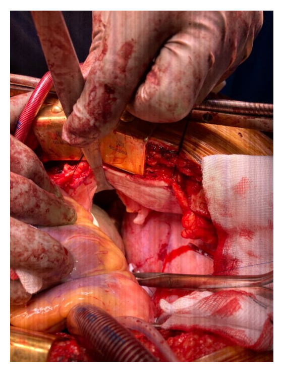
Figure 3. Intraoperative finding of large pericardial defect.

and a left sided consolidation. The decision was made to return the patient to theatre for replacement of the Swan-Ganz catheter and exploration of the pericardial repair, to investigate any surgical repairable cause of his cardiac instability.