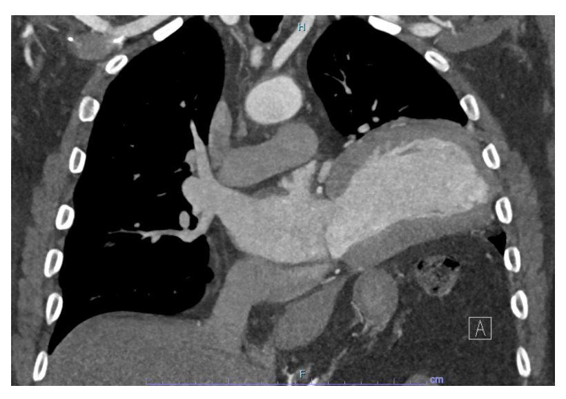
Figure 2. Pre-operative CT chest showing transverse lie of the heart.

Intraoperatively a large left sided defect of the pericardium was found, measuring approximately 15 cm \times 10 cm, with complete herniation of the heart into the left thoracic cavity ( Figure 3 ); with a raised and fixed hemidiaphragm. The heart was angled transversely and was rotated to the left, with the pulmonary artery laying posterior to the aorta to such a degree that the Ross procedure was aborted due to poor access to the pulmonary valve. The patient instead received a bioprosthetic aortic valve replacement and Dacron grafting of the ascending aorta. The left sided pericardium was shredded and mostly missing, including the portion where the phrenic nerve usually lies. This finding likely explains the raised left hemi-diaphragm. The injury is proposed to have occurred during his previous accidents. No pericardial fluid was found, and the left lung was visible through the vent in the pericardium, and there were no pleural adhesions.