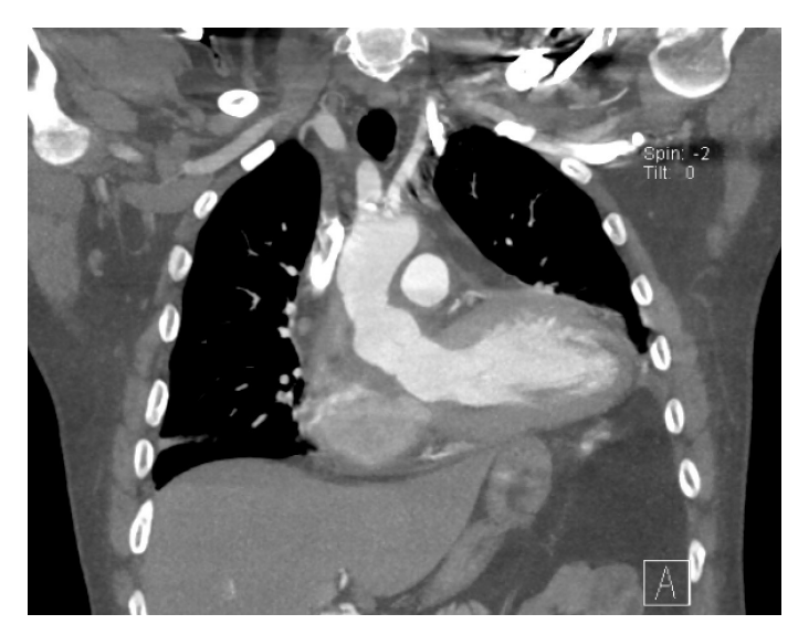
Figure 5. Post-operative CT post re-sternotomy and Gore-Tex membrane adjustment.