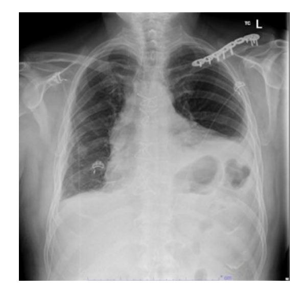
Figure 4. Post-operative chest radiograph taken day 3 post re-sternotomy and Gore-Tex membrane adjustment.