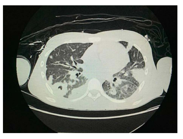
Figure 2. CT of the chest with contrast demonstrating multifocal consolidations, some with cavitation, consistent with septic emboli.

Figure 1. CTA of the head and neck demonstrating thrombus in the right internal jugular vein (black arrow) with surrounding soft tissue edema.