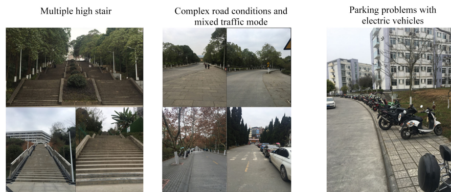
Figure 3. Campus traffic situation.

The influence of environment on behavior makes people’s behavior have the characteristics of environmental adaptability (Zhang, 2019). From the figure, we can draw a conclusion that both saving distance and reducing the number of steps are physical consumption of human behavior, and only after long-term calculation of behavior habits can we determine that the electric vehicle program