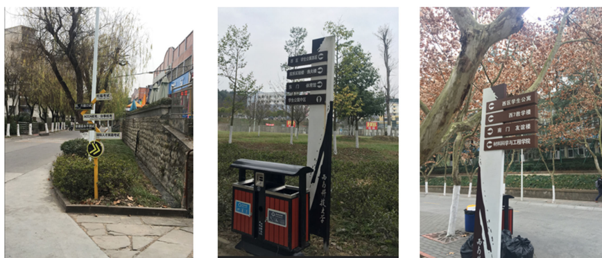
Figure 5. Status diagram of identification system.

Indicator signs in different forms, directivity is not obvious