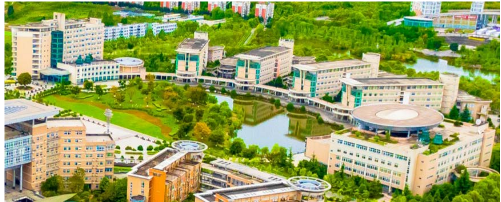
Figure 1. Space environment of East 1st to East 4th Teaching Building in the New District of South-west University of Science and Technology.