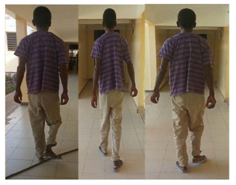
Figure 3. The patient walking with a brace on day 3 after surgery.