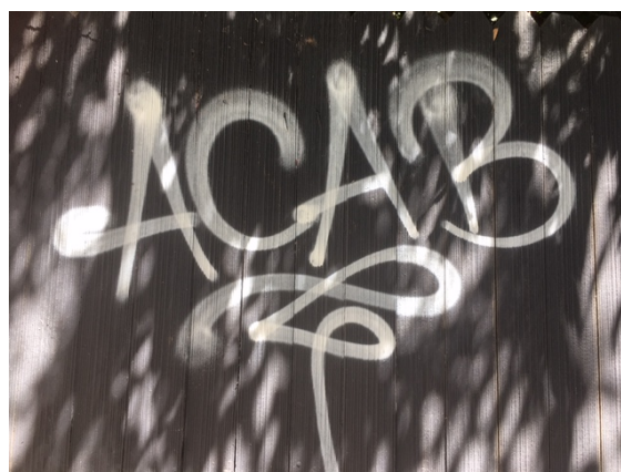
Figure 5. Fence Alley, Los Angeles.

practices is demonstrated in protest graffiti's radical call for complete overhaul of the system by defunding the police. According to the BLM website, "Defund the Police," demands just that. Their website states: