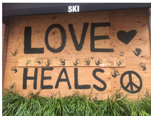
Figure 15. Love Heals Graffiti Santa Monica.

“Love Heals” offers love as the antidote to rage and protest—both suggesting a fabricated purgation of emotions. While it is true that “hope, hope, optimism and pride, can facilitate political protest,” as Sabucedo & Vilas (2014) contend, it is moreover true that optimism cannot be manufactured by protestors not suffering from the racial oppression that instigated the protests in the first place (p. 831).