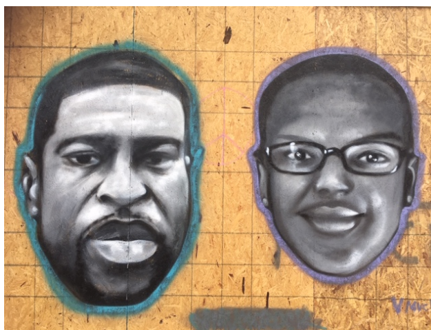
Figure 12. Floyd and Breonna Taylor on Wall in Santa Monica.

In the final category, time has passed and the graffiti reflects the visual evolution from anarchy to prognostic, sometimes propaganda frames of hope and possibilities of racial justice. In these frames, graffiti messaging aims to inspire hope that the desired future will happen (Jarymowicz & Bartal, 2006). Figure 13 testifies to a turn in emotions and a purgation of rage and anger to emotions of empathy, optimism and pride. In this visual rhetoric, Floyd has a halo of different