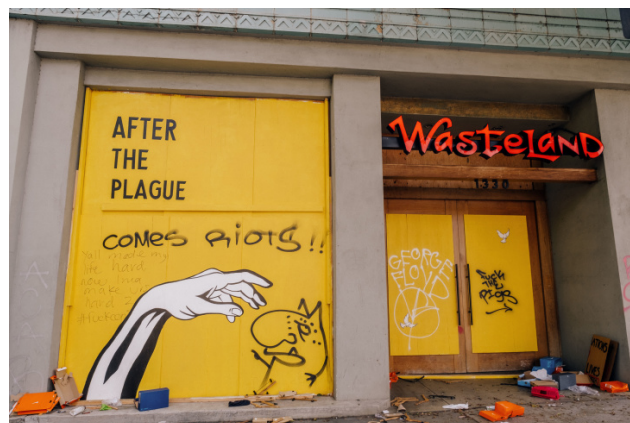
Figure 1. Graffiti in Santa Monica linking Covid to the Riots.