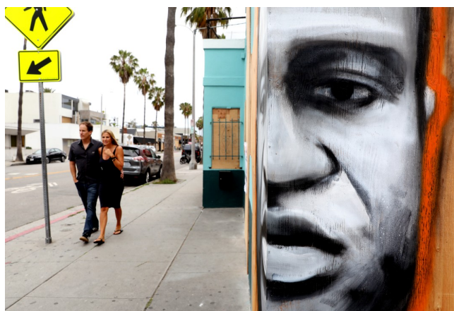
Figure 10. Los Angeles Street Corner.

Whites and others often stigmatize anonymous black persons by associating them with the putative danger, crime, and poverty of the iconic ghetto, typically leaving blacks with much to prove before being able to establish trusting relations with them. Accordingly, the most easily tolerated black person in the white space is often one who is 'in his place'—that is, one who is working as a janitor or a service person or one who has been vouched for by white people in good standing. Such a person may be believed to be less likely to disturb the implicit racial order—whites as dominant and blacks as subordinate. (p. 13)