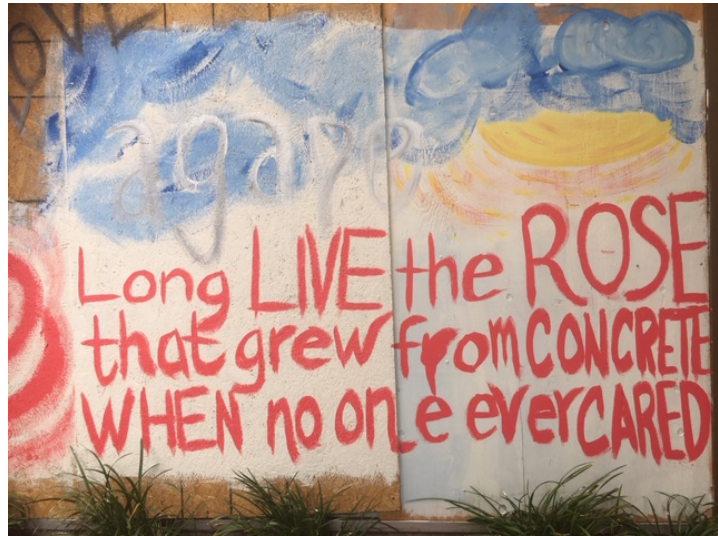
Figure 16. Tupac Shakur's poem in Santa Monica.

Understanding the context of the poem is crucial. Tupac refers to his own life growing up in an urban concrete ghetto and proving nature wrong, and flourishing nonetheless. The irony of this graffiti comes within the context of the situation—numerous deaths of blacks unable to catch a breath. Tupac gasped his last breath at the age of 25 in Las Vegas, Nevada in a drive by shooting. Floyd died by a suffocating chokehold. The situational irony in the Tupac graffiti quotation at first glance provides catharsis: “Long Live the rose that grew from concrete when no one else ever cared.” Sadly, Floyd and many blacks (male and female) have been systematically subjugated and unable to breathe in a system that continues to suffocate their humanity. Black lives live amidst a crushing system that tries to snuff them out. Yet, in spite of the continued subjugation, black lives triumph over these conditions and continue to reach for a piece of the American dream.