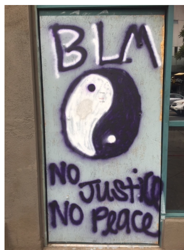
Figure 8. Store Window Santa Monica.