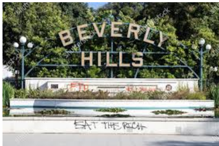
Figure 6. Graffiti Eat the Rich in Beverly Hills, California.

Another popular graffiti image that emerged is the clenched raised fist extended upward, which is a symbol of defiance and black power that visually attempts to intervene in superordinate/subordinate structures. The iconic image of resistance has a compelling history dating back to the Civil Rights Movement in the 1960s when Stokely Carmichael adopted the slogan at the Poor People’s Campaign in Washington D.C. to bring attention to the systematic oppression of