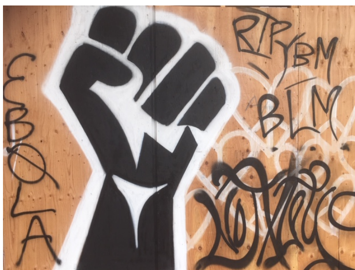
Figure 7. Fist on Boarded up wall in Santa Monica.

Anger and resentment circulates through urban spaces with the battle cry: