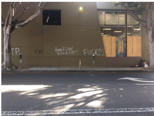
Figure 4. CVS, Santa Monica, CA.