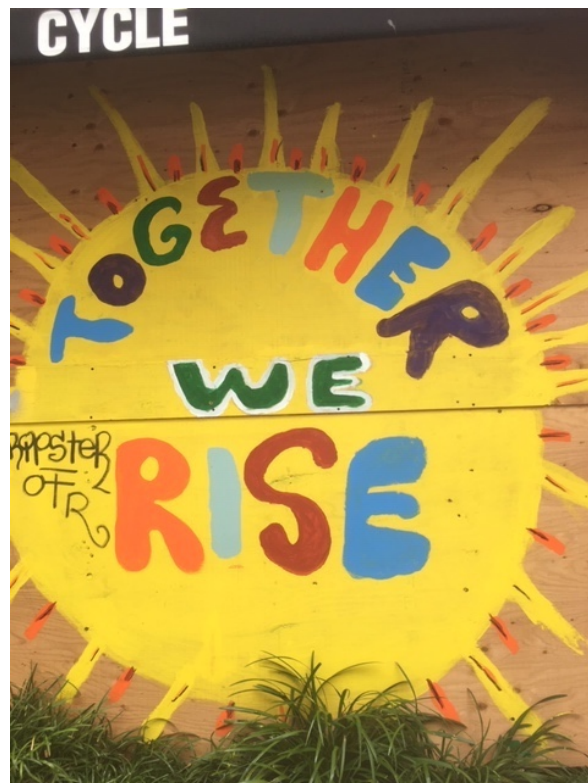
Figure 14. Graffiti on Boarded up Sign at REI Santa Monica).

The next visual discourse, Figure 14 and Figure 15 , offers declarations of hope, love, and solidarity for humanity functioning to arouse affective elements of healing and positive outcomes for the future. “TOGETHER WE RISE” written in primary colors inside a yellow sun offers hope of new beginnings and rebirth.