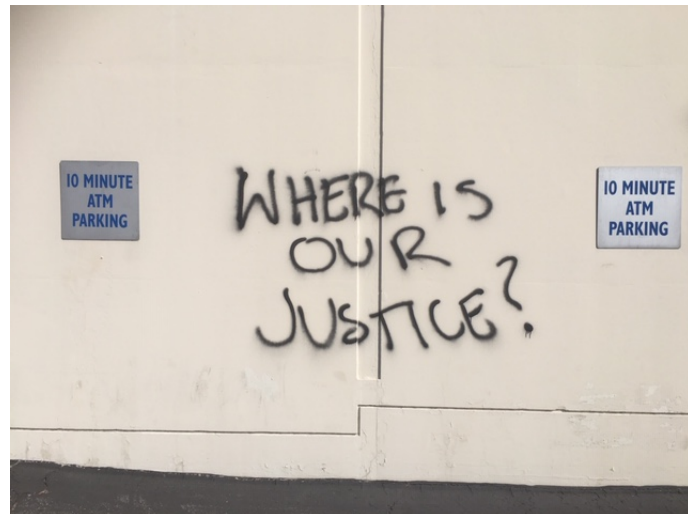
Figure 3. Tagging on Bank of America in Santa Monica.

the graffiti establishes Cecric Robinson's interconnecting systems of race, violence, and capitalism best articulated in BLM's statement on structural racism: