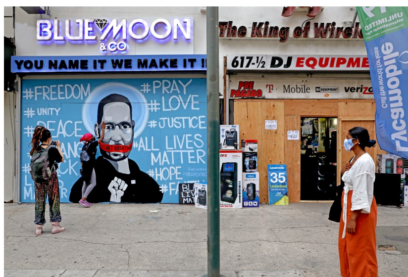
Figure 13. Los Angeles Street Corner.