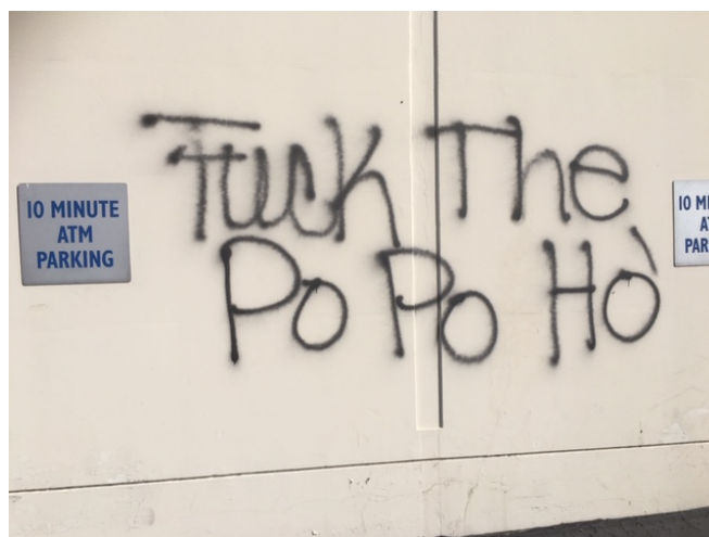
Figure 2. Tagging on bank of America wall in Santa Monica.

The question of justice and injustice strike at the heart of the BLM Movement and articulates a deeper call for structural change. Whether intentional or not,